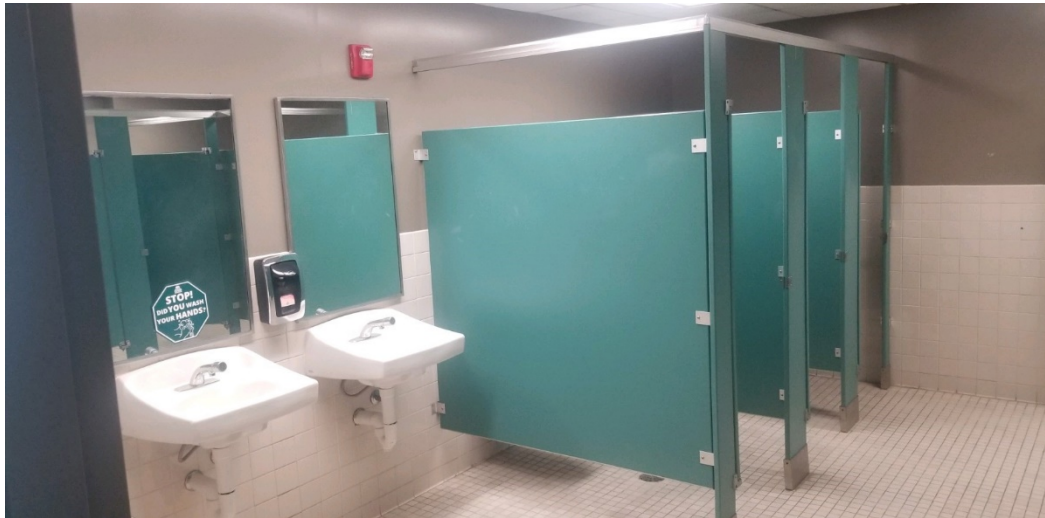
Thousand Oaks High School