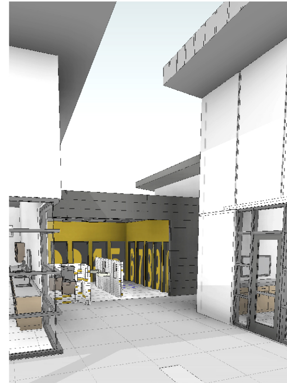
2 ALL GENDER VIEW 3 SCALE: